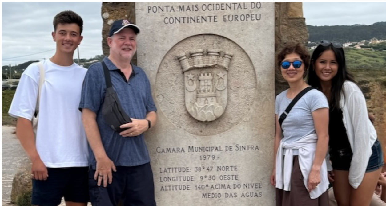
Standing at the edge of Europe—celebrating a brand-new chapter.

It was more than a vacation. It was a bridge between a demanding, meaningful professional life and whatever comes next.