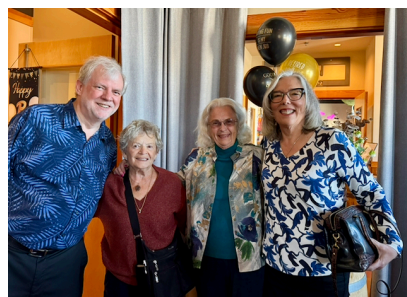
Grateful for retirement joy back home.