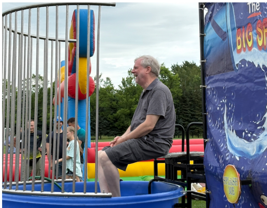
Retirement has its ups and downs. (Mostly down.)