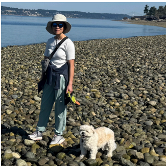
Home looks good on all of us.