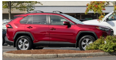
New wheels for the next chapter.