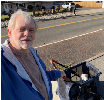
Rascal rides in style.