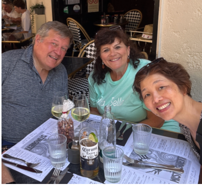
Travel is sooooo much better with lifelong friends.