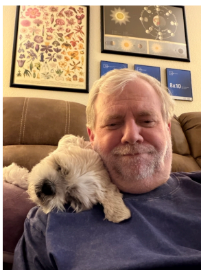
Recovery buddy duty.