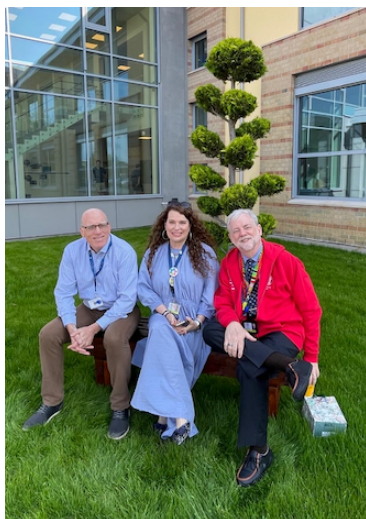
A treasured finale with treasured leaders.