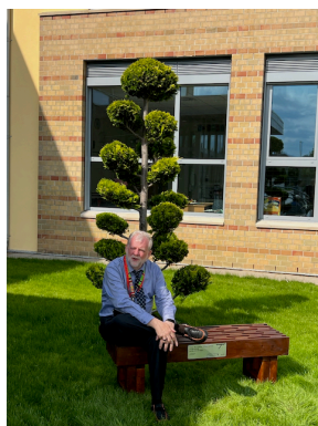
Saying goodbye is never simple.