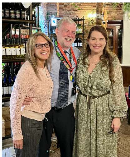
Retirement sweeter with good friends and many memories.