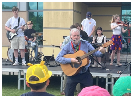
Some things never change: music, kids, and community.

We miss ASW more than we can say. To our ASW friends: thank you for the joy, the partnership, the laughter, the work, and the incredible community. We send our love across the miles, and we're cheering you on as you continue serving kids and building community with excellence and heart.