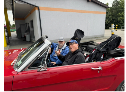
Old friends, new roads.

We arrived back home in July and settled into life in University Place. Repatriation has been both sweet and strange—wonderful to be near family and familiar places, and also a reminder that much here is complicated (doctor networks, Medicare, and the fine print of everything). We're making progress, slowly, and learning to laugh as we go.