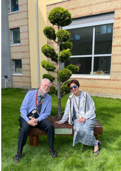
A quiet moment in a loud year at my tree that lives on at ASW.